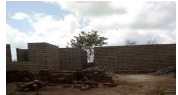
Ongoing Construction of mobilization Centre for green concrete technology Research

With the help of well-wishers and friends from local and international levels, we are on a forefront to construct a model secondary school with well furnished boarding facilities and classrooms, favorable and with conducive learning environment where special technologies are to be applied for example, use of - Green concrete technology which is environmentally and economically friendly, - Biological treated Toilets for long term and good hygienic environment, - Solar Power' alternative, which is dependable, where long lasting panels are to be installed.