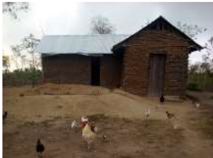
Experimetary Chicken Project for students and Historical House

Practical teaching enables students to acquire necessary elementary skills which can mentor them into highly skilled personnel and also helps to discover their hidden God given talents, hence producing directly beneficial candidates to national Development.