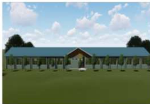
Future: Proposed classroom for 'Archangel Gabriel' High School Mkata