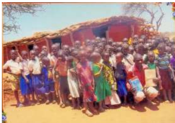
Today: Children at a rural school located in the neighborwood of Mkata

Reduced and later eliminate the high number of illiterates in rural areas, especially in girl child where early marriages and early pregnancies have proved a great risk to their lives because of lack of knowledge hence, creating generational extended poverty in societies. This can be achieved through accessing rural communities with good, motivational and conducive leaning environment.