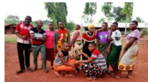
A group Photo for village Girls and Boys yawning for quality education

It will a mixed school (girls and boys) but emphasis put on girl child, to the fact that mothers are strong pillars of national Development, also not forgetting other vulnerable groups like, the disabled and orphans.